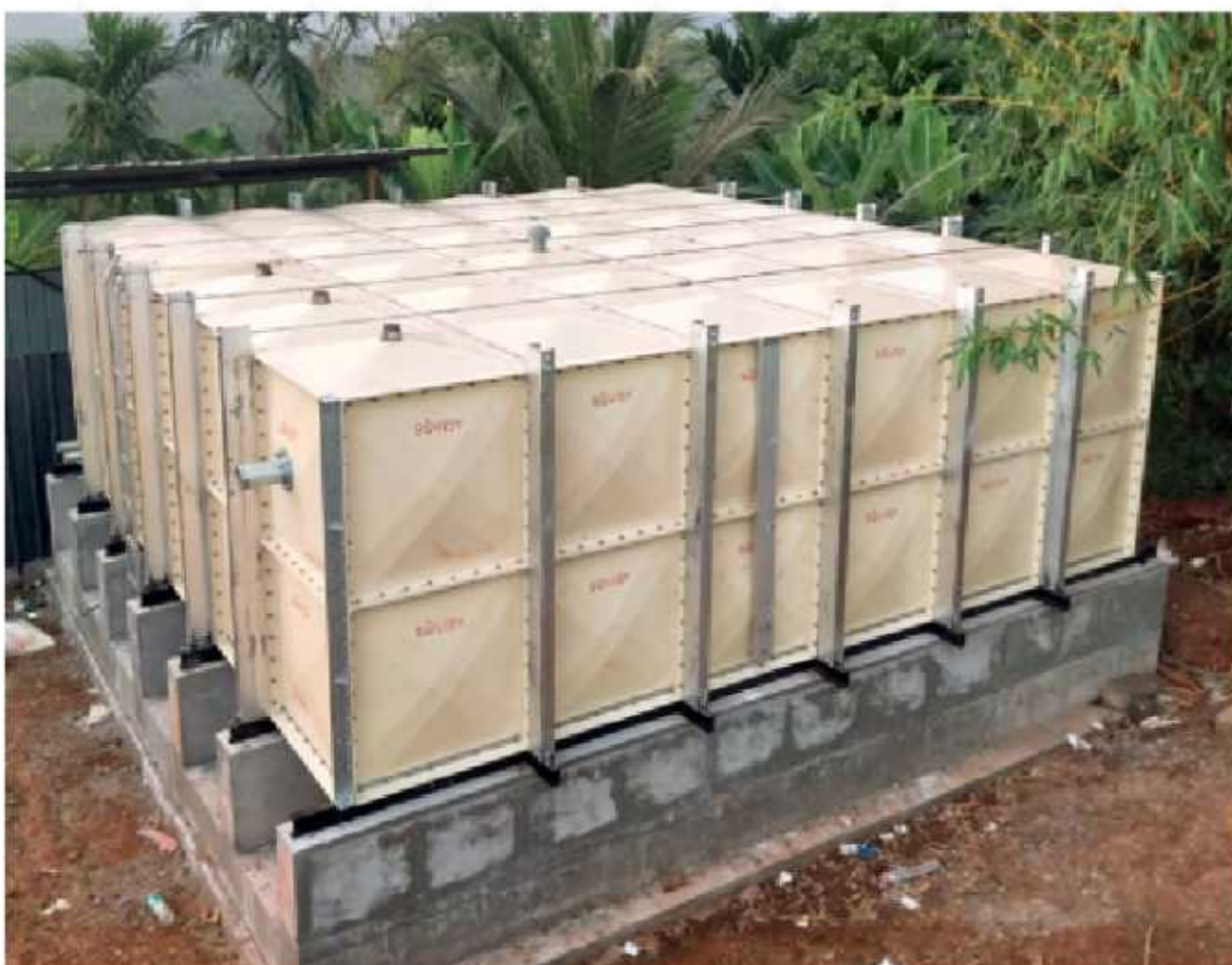
Malabar Medical College Calicut