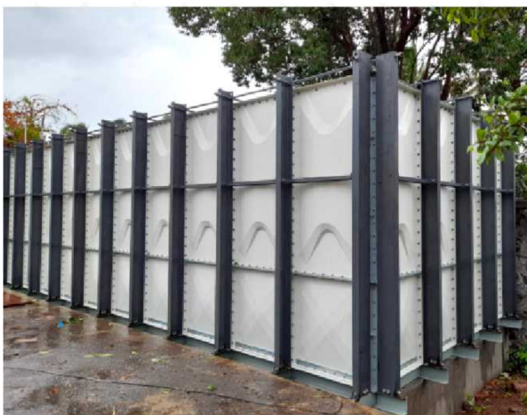
Reliance Corporate Park – Mumbai