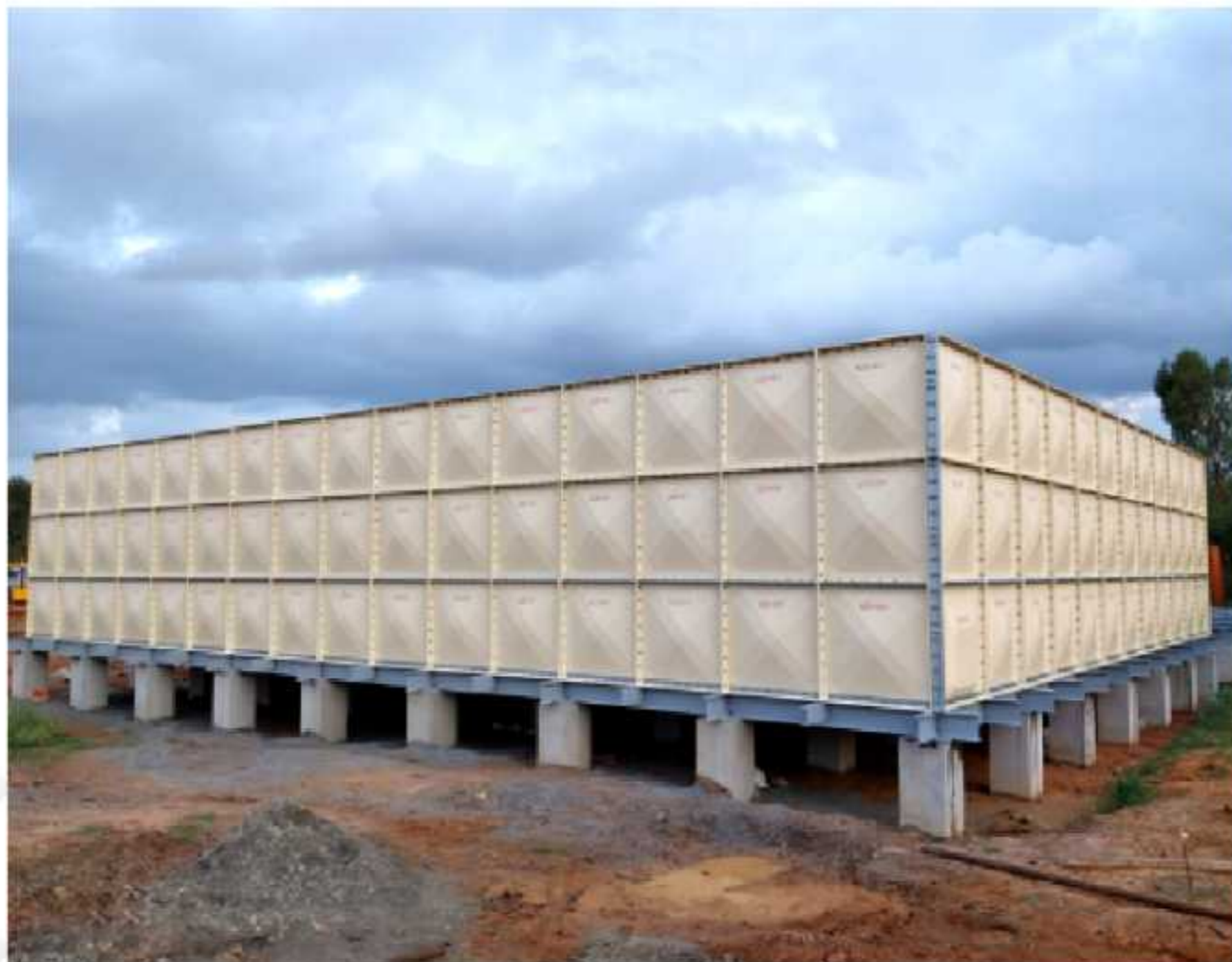
Kempegowda International Airport