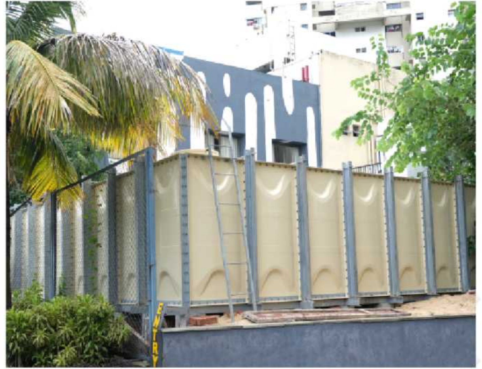
Ambuja Neotia– Kolkata