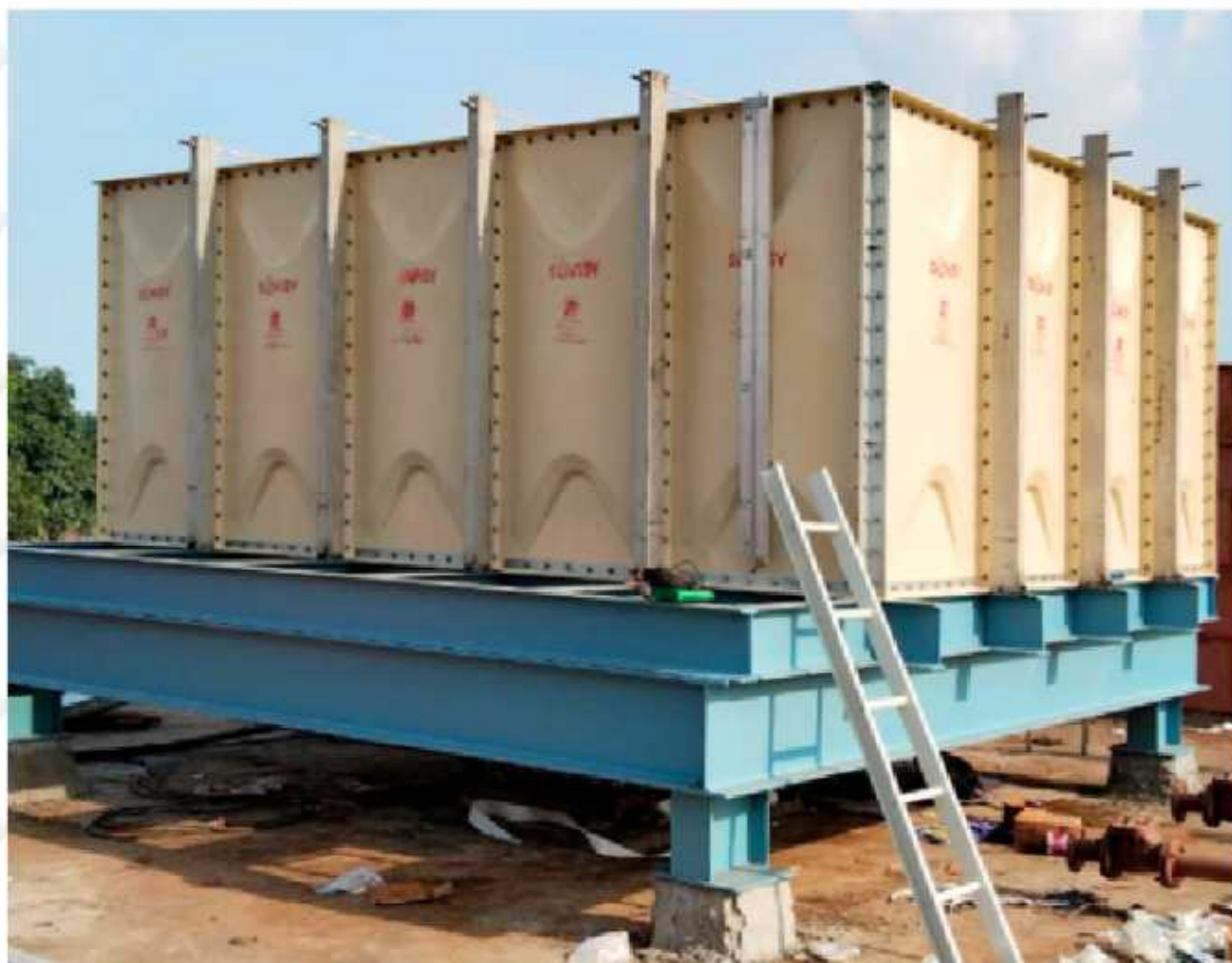
Fire Station: Chandni Chawk, NEW Delhi