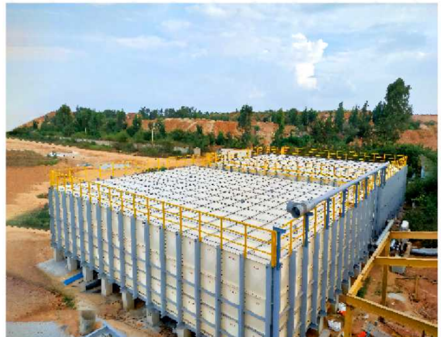
Kempegowda International Airport