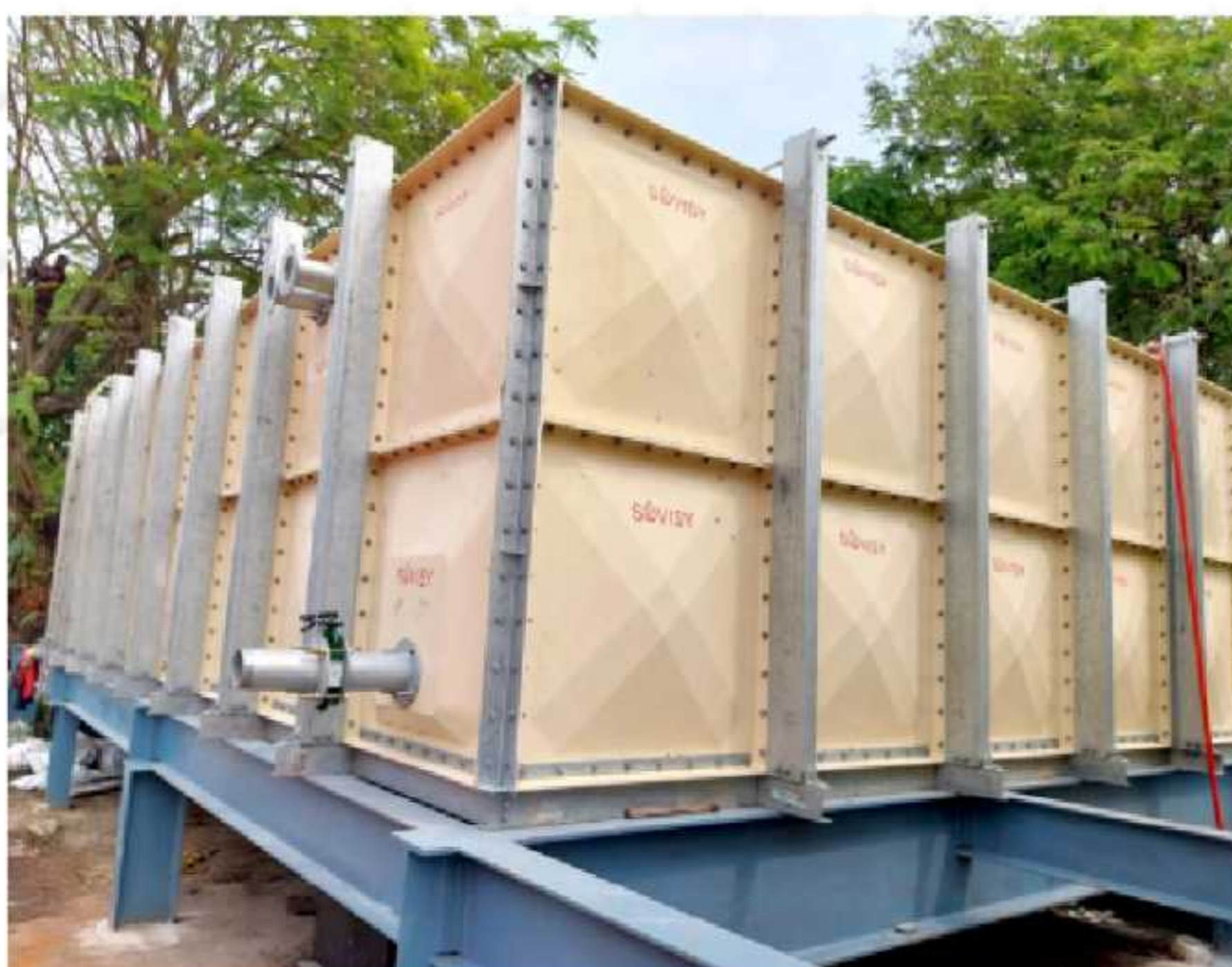
Mukesh Ambani House – Jamnagar, Gujarat