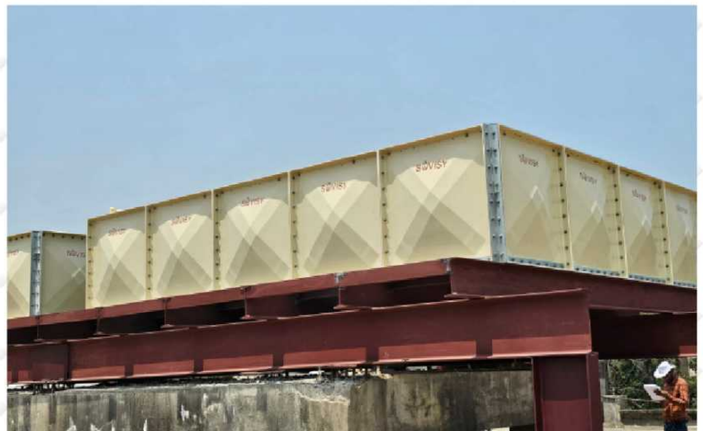
ESIC Hospital – Kolhapur