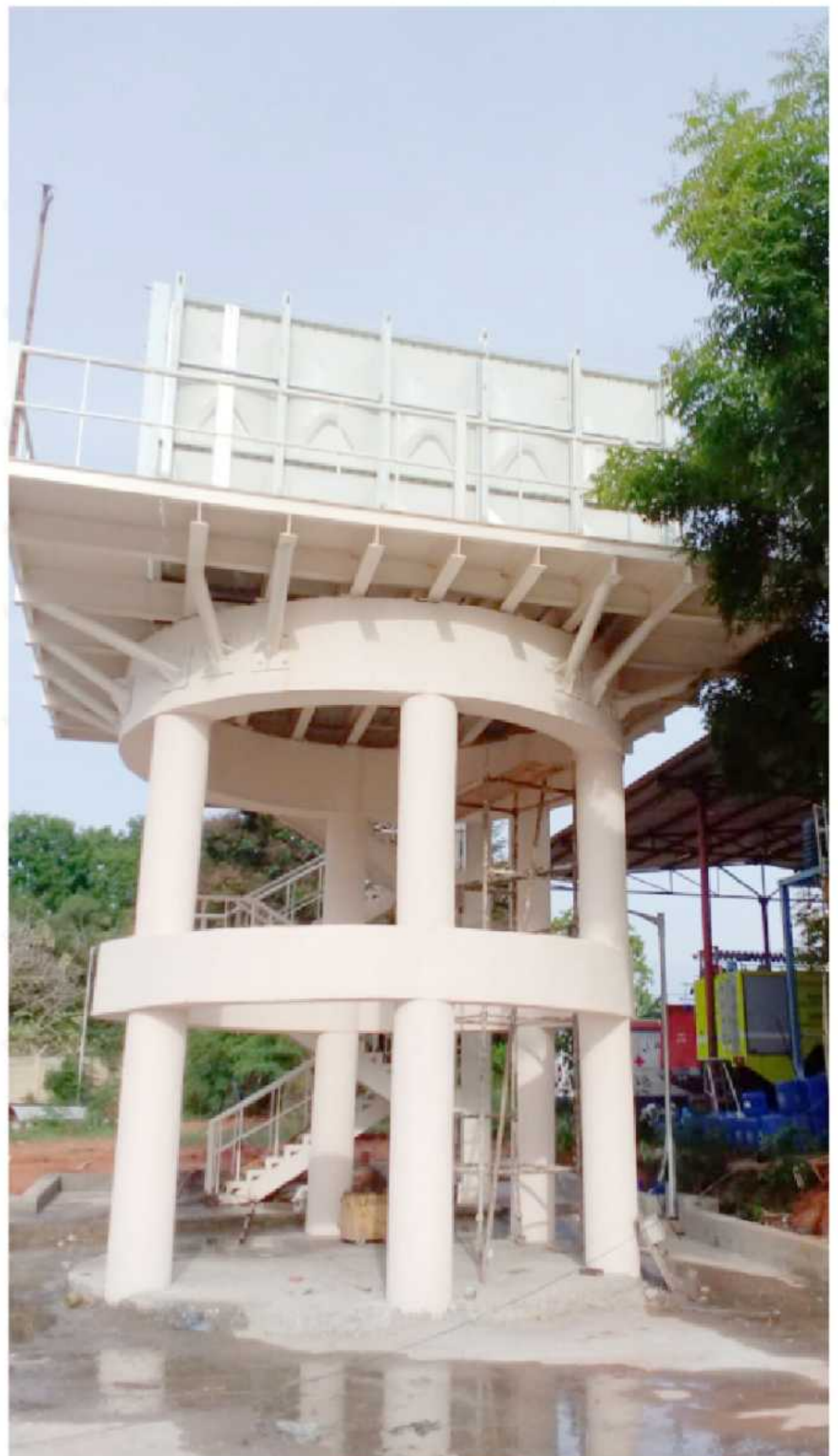
Puducherry Airport – Pondicherry