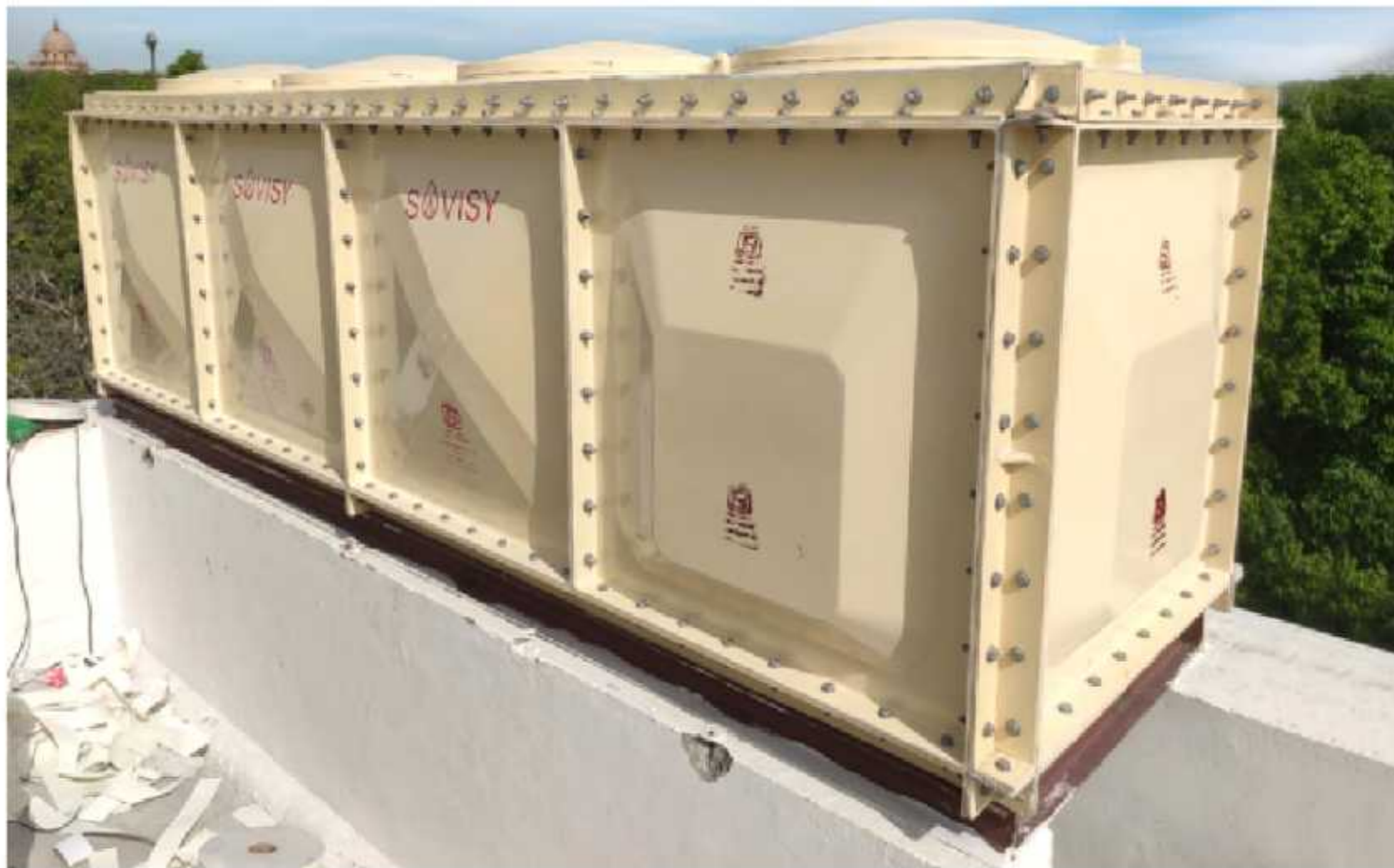
Rashtrapati Bhawan – New Delhi