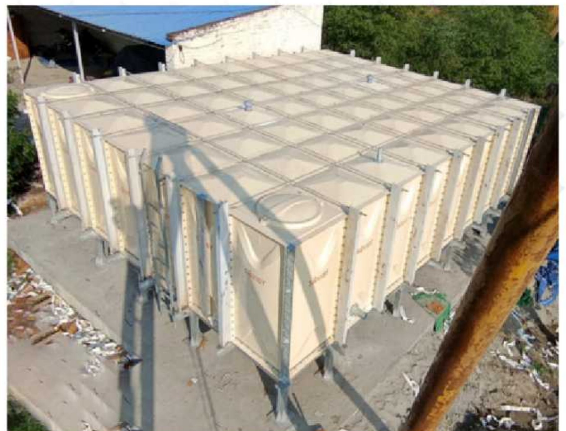
Himachal Pradesh Cricket Association