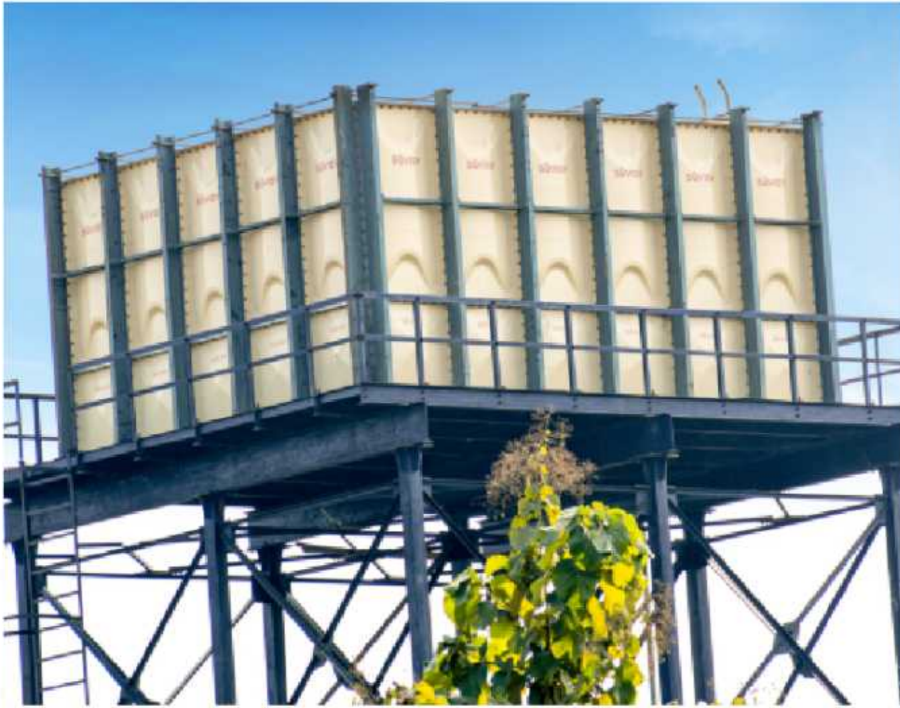
Jal Jeevan Mission – Assam