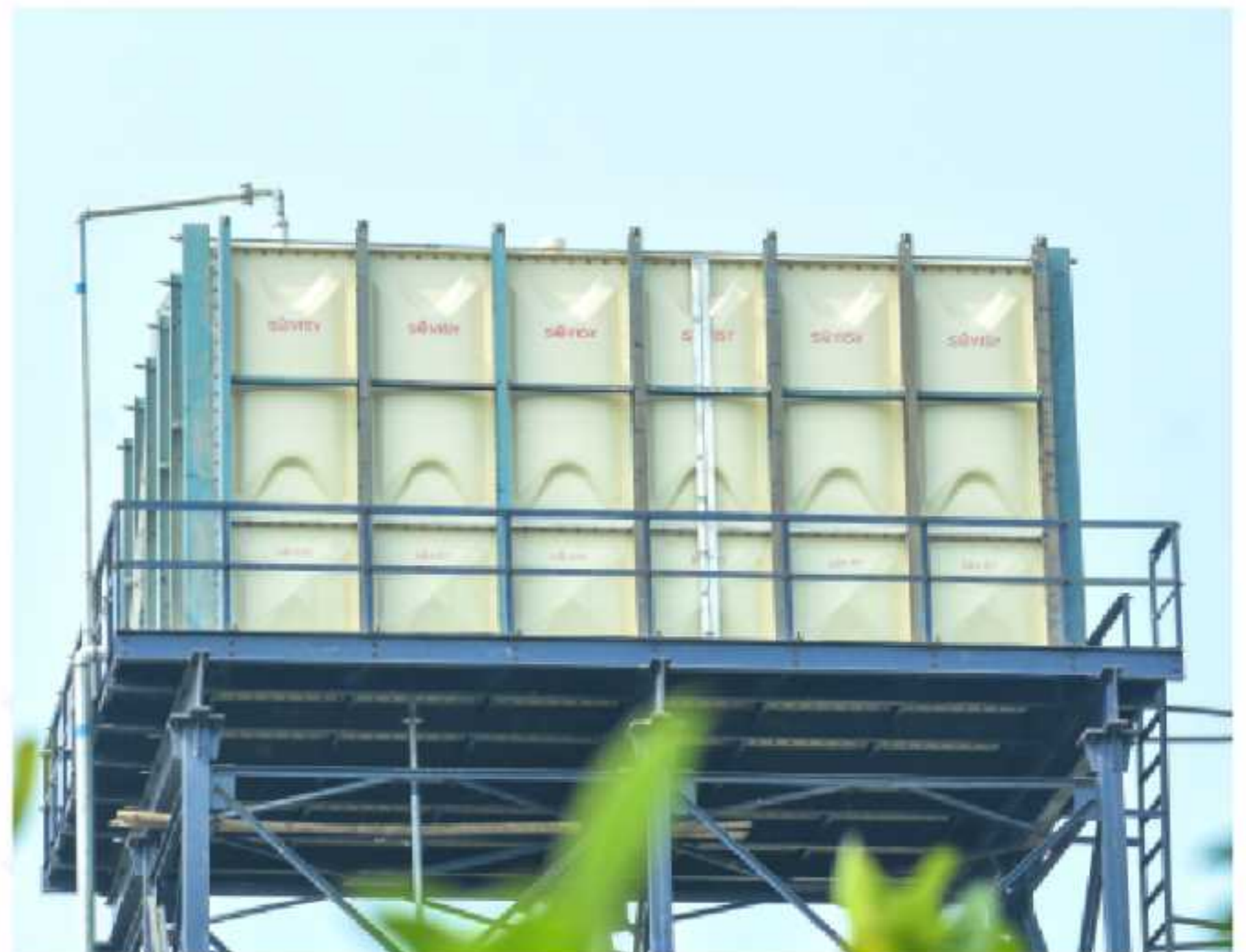
Jal Jeevan Mission – Assam