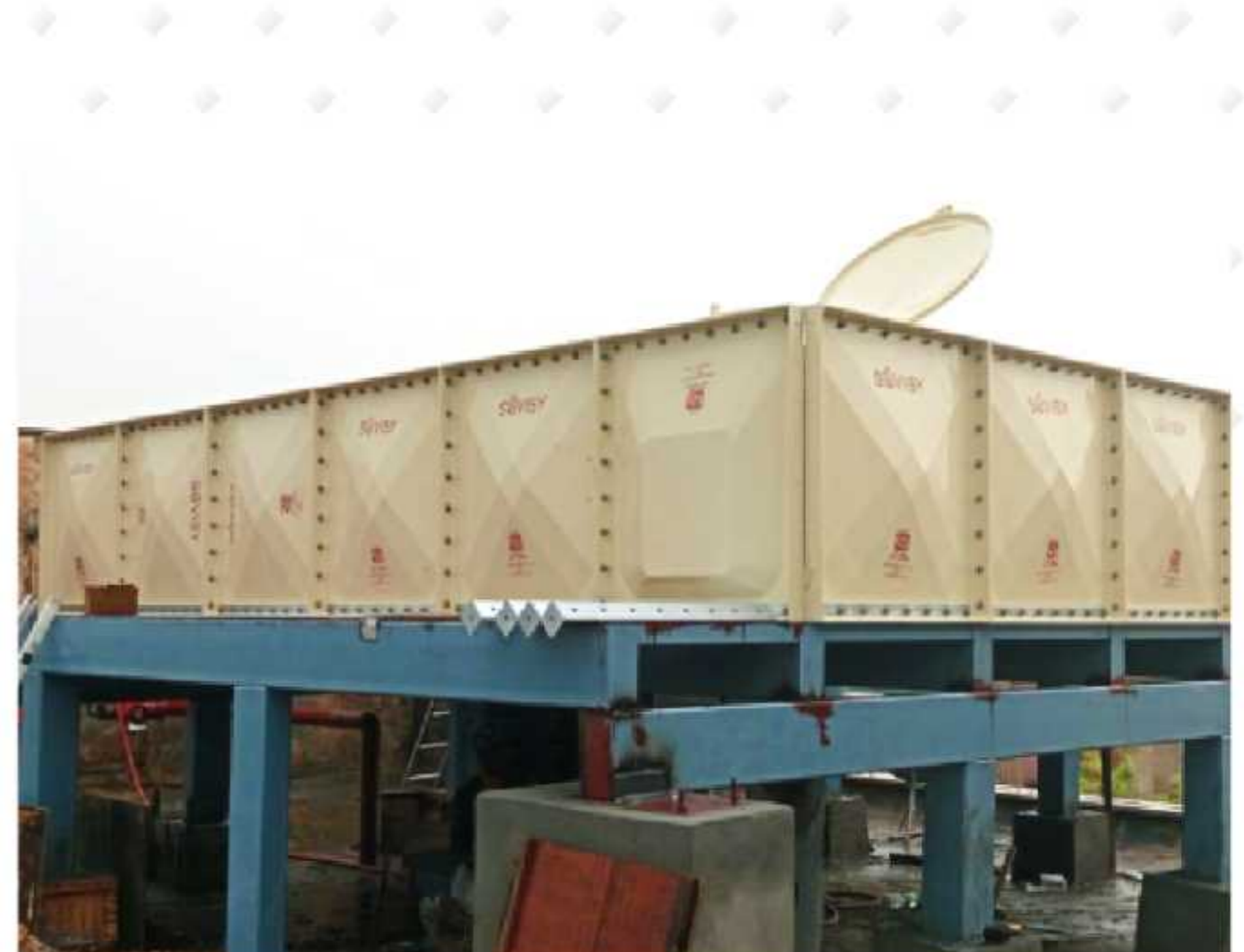
Supreme Court – New Delhi