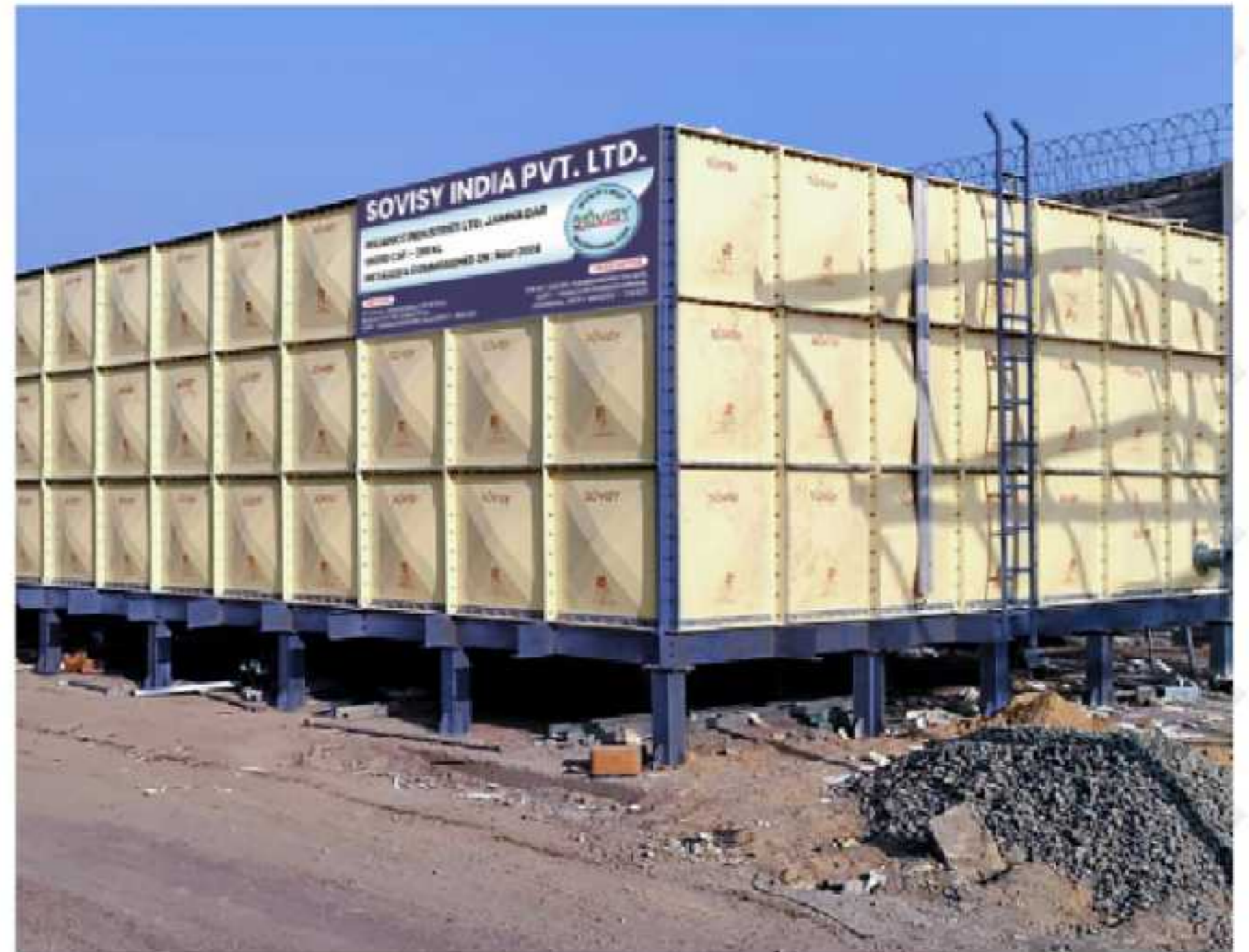
Reliance Industries Ltd., Jamnagar