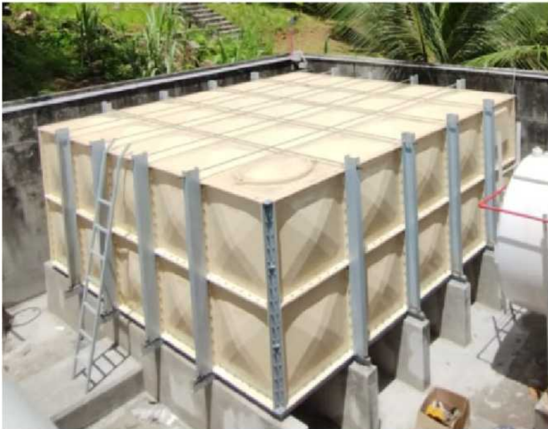
Dhimapur Medical College, Nagaland