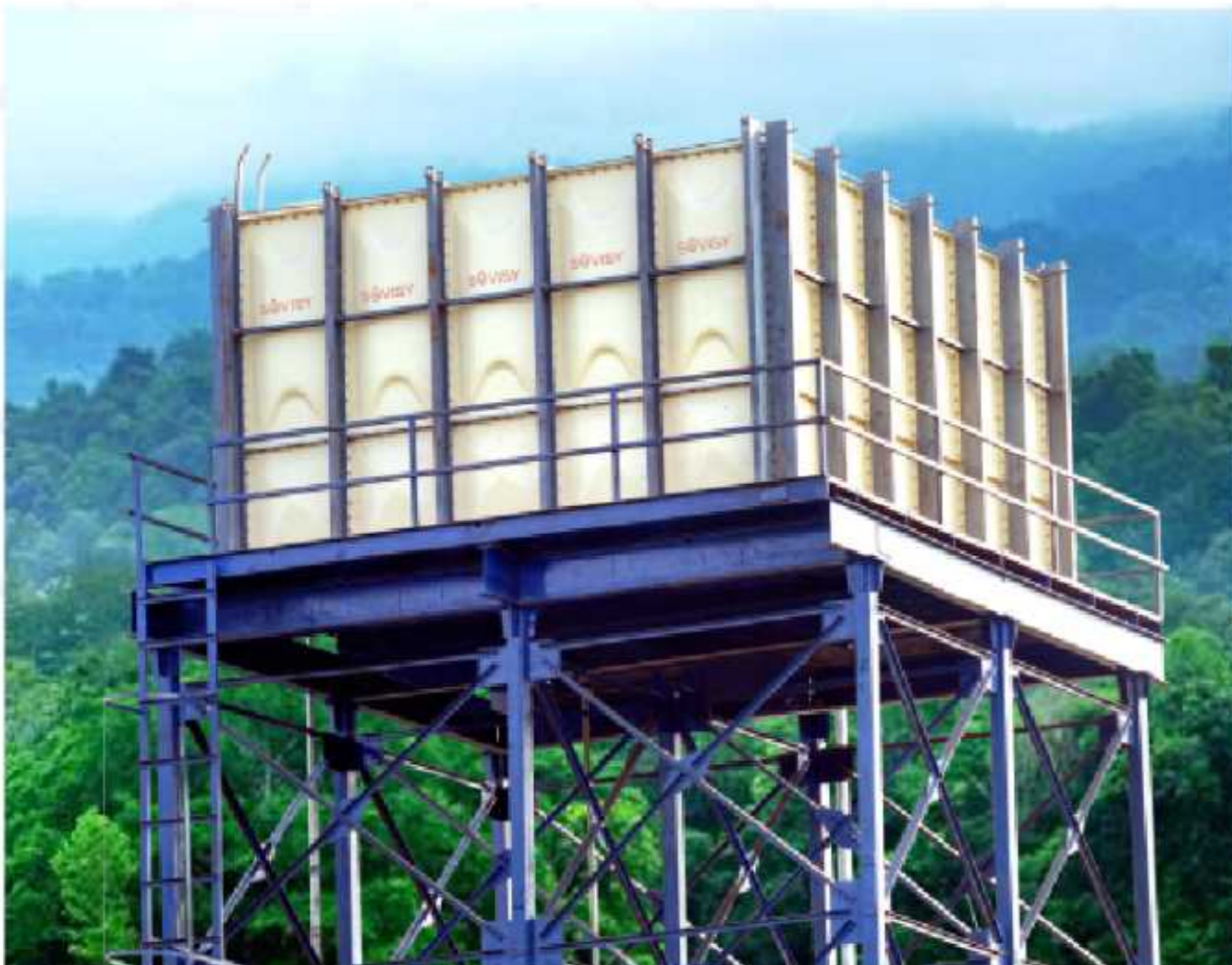
Jal Jeevan Mission – Assam